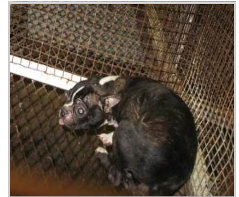
Dog in West Point, Iowa mill. The 130 dogs at this kennel live in darkness much of the time

Iowa has the 2 nd largest number of puppy mills in the nation with more than 350