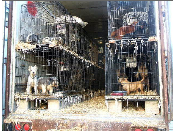
Iowa puppy mill in a semi-trailer; no heat no ventilation, no running water

A puppy mill is a commercial dog-breeding operation with an emphasis on high-volume puppy production for sale to dog brokers and to the public. The adult breeding dogs are typically confined in cramped wire cages and kept year-round in substandard or makeshift facilities with little or no heat, ventilation, or sanitation features . The animals' basic health needs; exercise, veterinary care, and social interaction - are routinely ignored, often resulting in serious physical and psychological disorders .