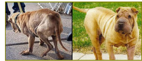
Before: This emaciated Shar-pei with atrophy of the legs was rescued from an Iowa puppy mill.

Learn more by visiting our website www.IowaVCA.org