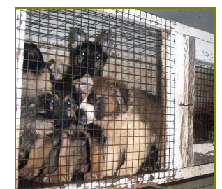
Inadequate cage in a New Sharon, IA puppy mill leaves no room to sit, turn or lay down.

Learn more by visiting our website www.IowaVCA.org